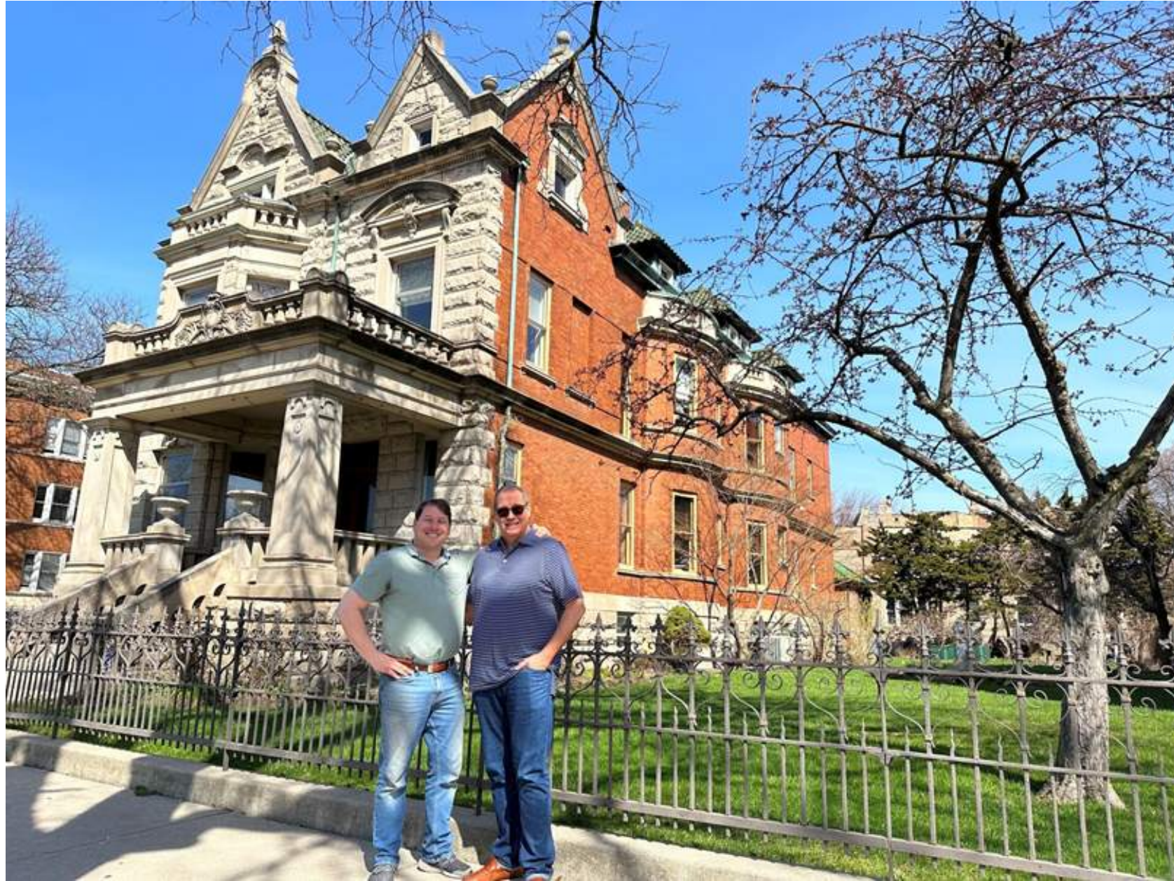
Jefferson Ice House, Logan Square