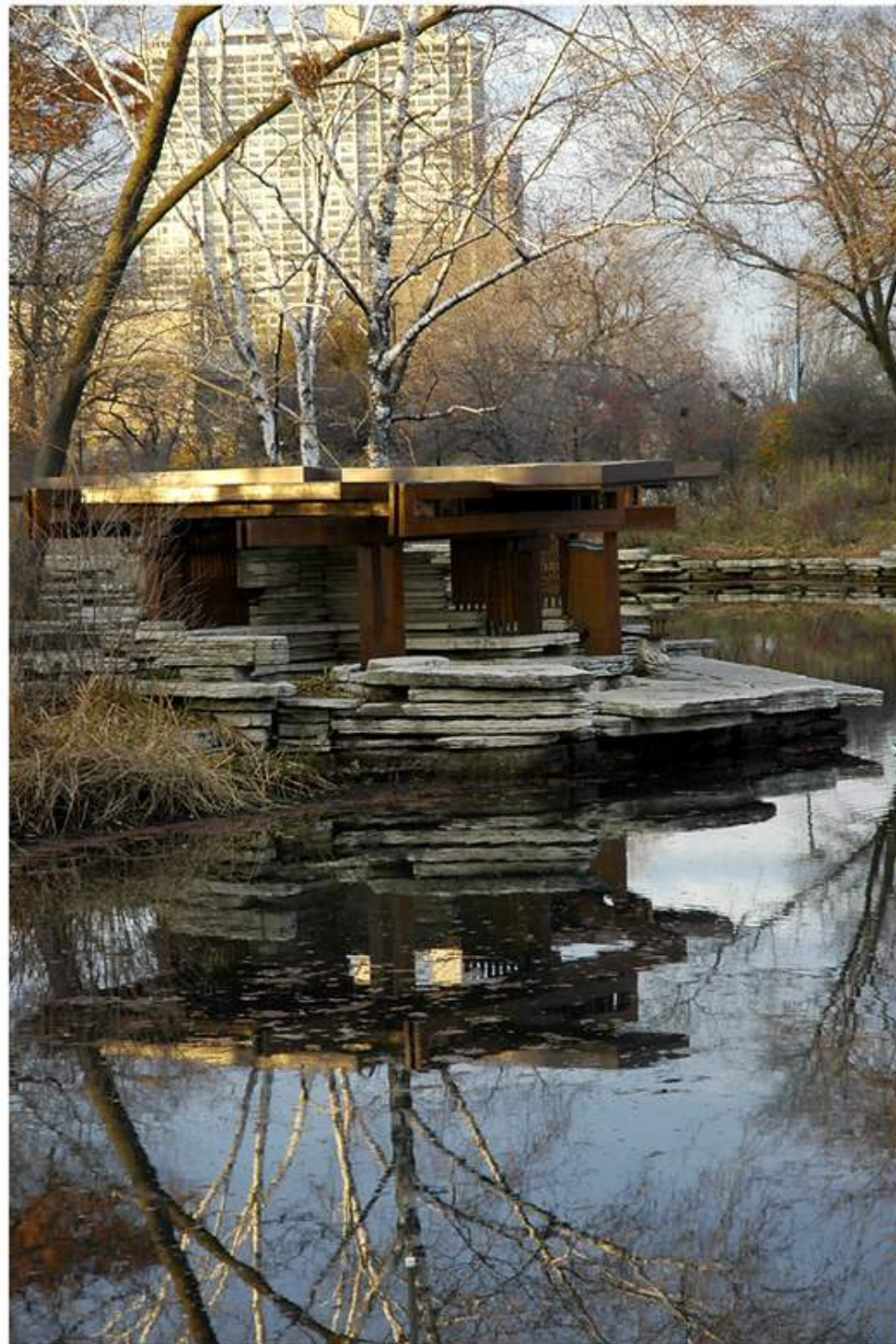
Alfred Caldwell Lily Pool