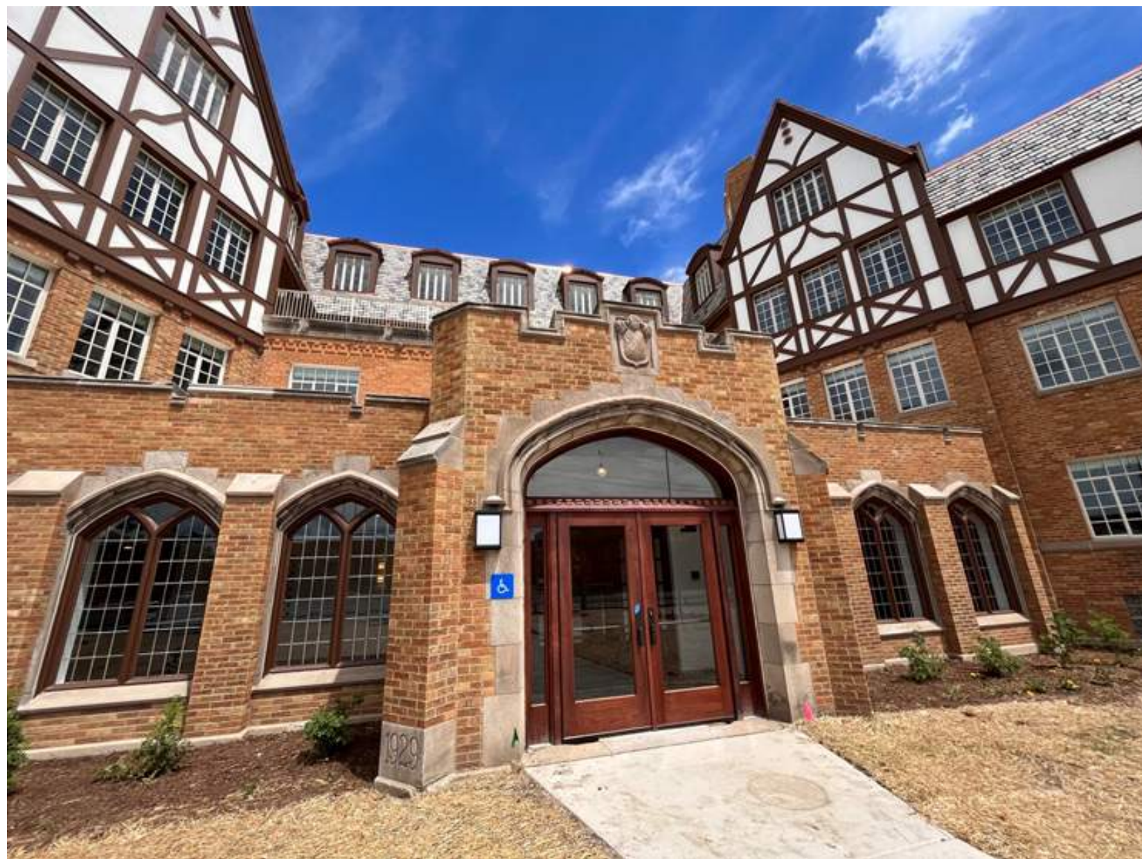
Maywood Supportive Living, Maywood