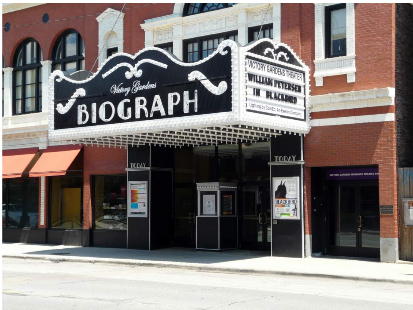
Biograph Theater