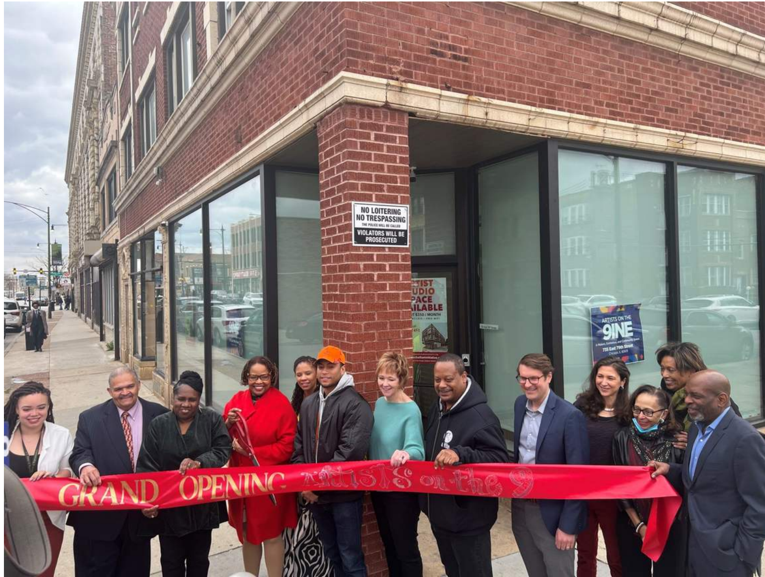
Artists on the 9, Chicago