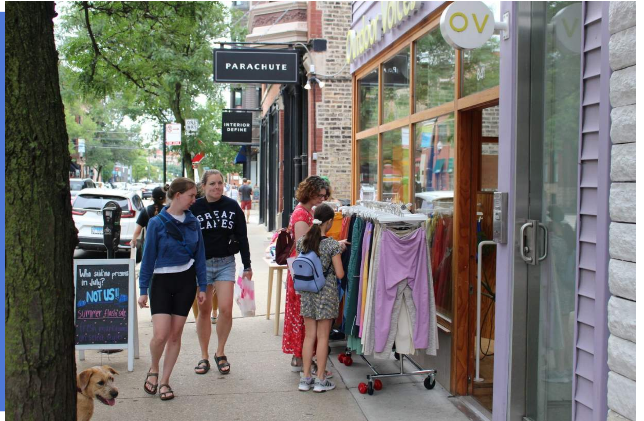
Armitage-Halsted Sidewalk Sale, Credit: Lincoln Park Chamber of Commerce