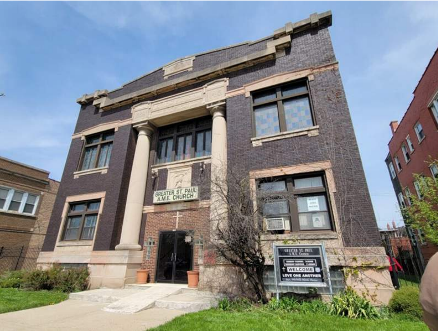
Greater St. Paul A.M.E. Church, Chicago